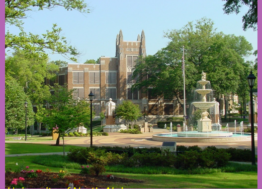
University of North Alabama