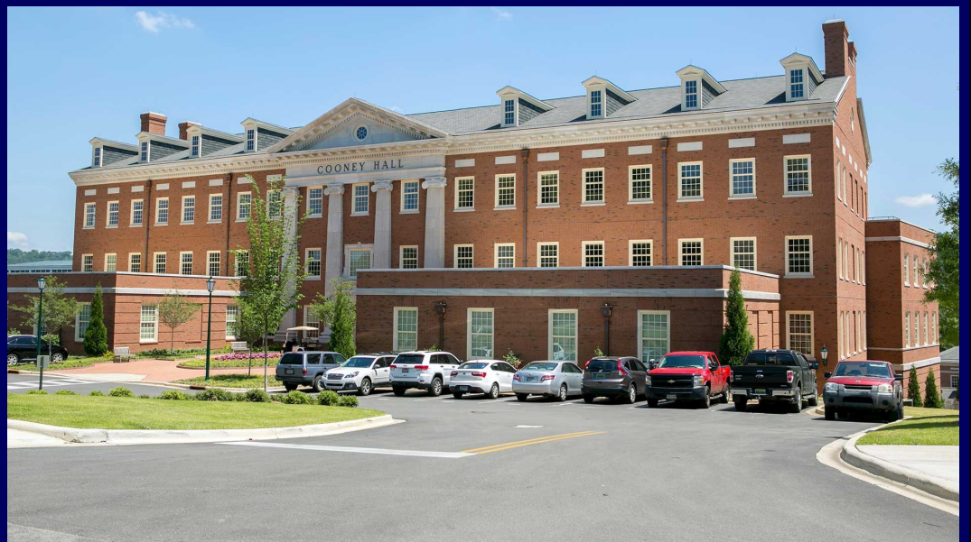
Samford University's Cooney Hall will be the main location for this year's ACA Convention.

-Top Research Paper Awards -ACA Award for Outstanding Teaching